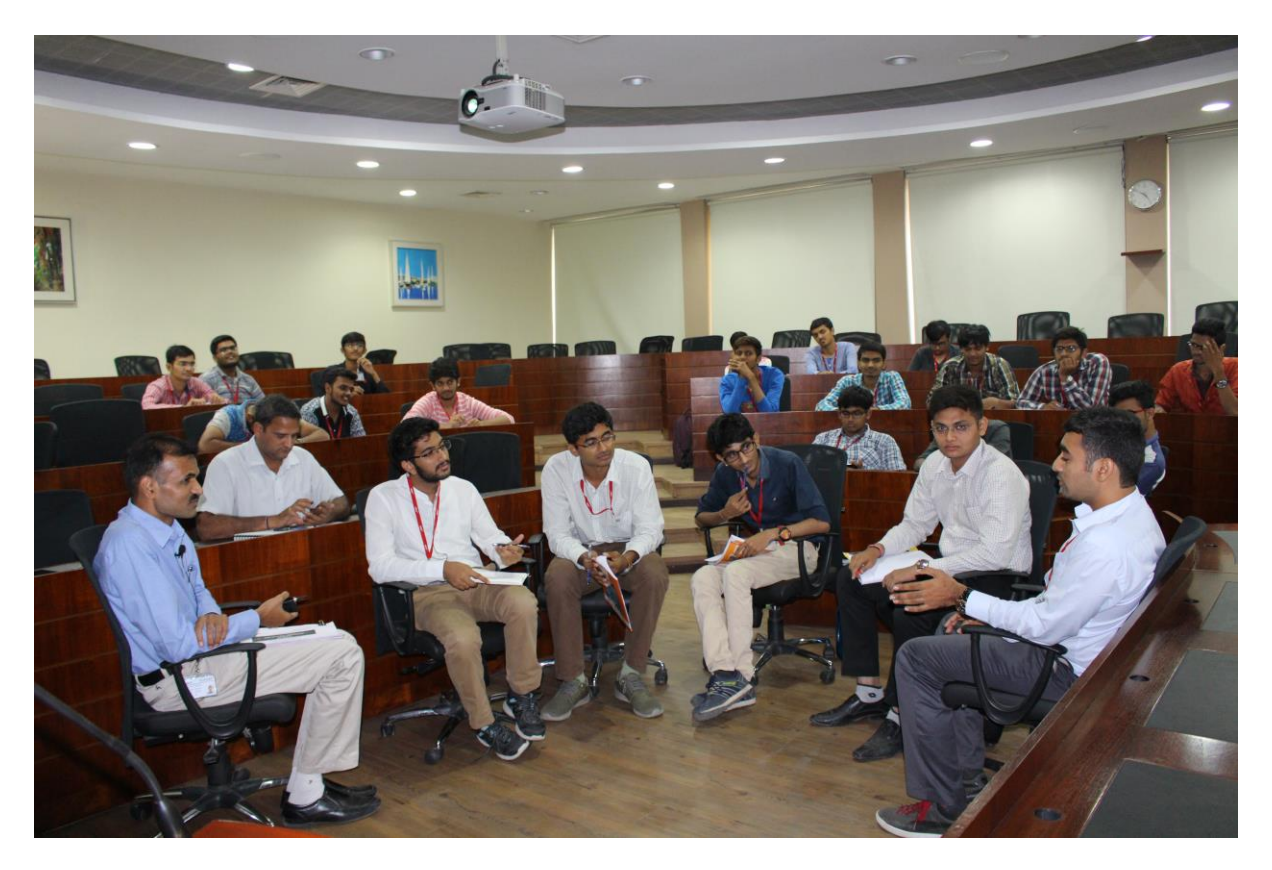
Image: Students during a panel discussion on Infrastructure & Technology, Studio Club Conclave