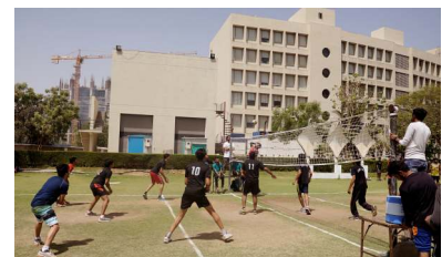
Incampus Volleyball Match