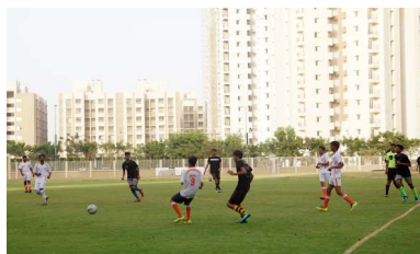
Football-Next to the Goal