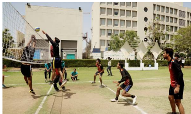
Action on the field

All conducted its Annual Sports and Cultural Festival, Aspire 2017, from April 7 to 9, 2017. It was a fun-packed event with games, cultural activities, a fashion show, music, stand-up comedy and much more.