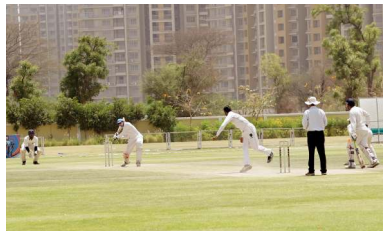
Cricket Match-Great Shot