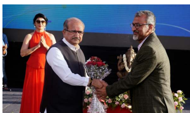
Education Minister & Director