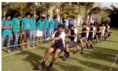
Fight with the Positive Spirit