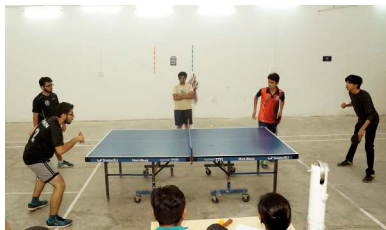
Table Tennis Match