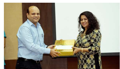
Keep it up - Proud Moment